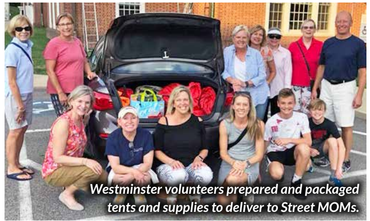
Westminster volunteers prepared and packaged tents and supplies to deliver to Street MOMs.