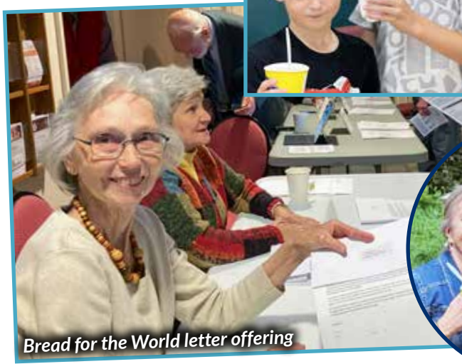
Bread for the World letter offering