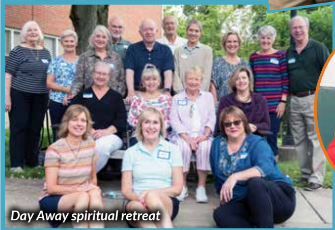
Day Away spiritual retreat