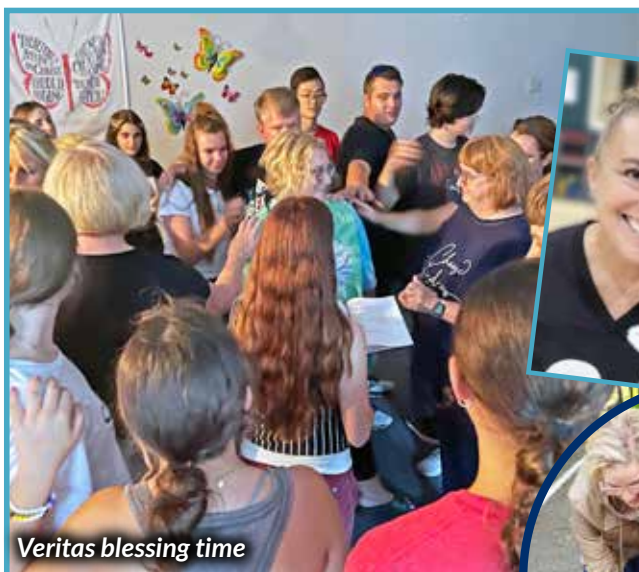
Veritas blessing time