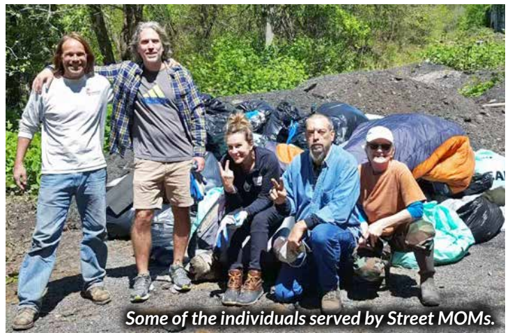
Some of the individuals served by Street MOMs.

I am going to continue to begin with Mother Teresa’s quote and look for ways to help one person at a time because that is not overwhelming, and I can do that. But the real target is the charge that Jesus has laid out for me, for all of us.