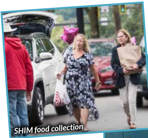
SHIM food collection