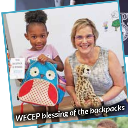
WECEP blessing of the backpacks